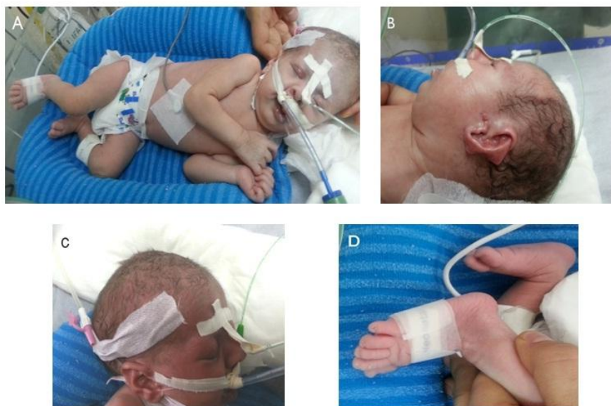
Fig. 1: Clinical features of the case A: dysmorphic features B: auricular tags C: frontal bossing D: Rocker bottom feet

Clinical examination showed that the child had a variety of abnormal clinical features including intrauterine growth retardation, frontal bossing, broad nasal bridge, low set and dysplastic ears with a skin tag, cleft palate, premature sutures and bottom feet (Fig. 1). Echocardiogram showed atrial septal defect (ASD) and systolic ejection of the left ventricle. Brain sonography revealed the hypoplasia of the corpus callosum and septum pellucidum. Peripapillary atrophy was remarkable according to ophthalmologic examination. Laboratory result for metabolic screening and congenital infections were normal. Sonography indicated that genital tract and kidneys were normal.