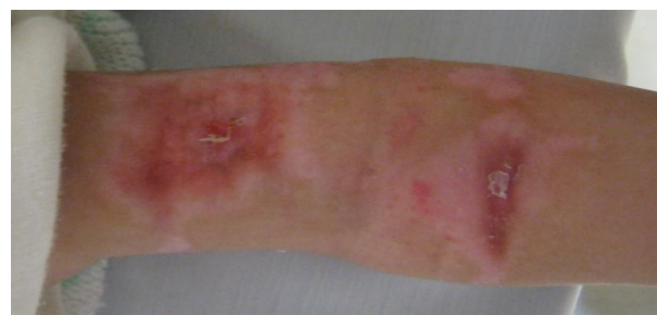
Figure 3. Burned Area After Two Weeks In the Irgel Group