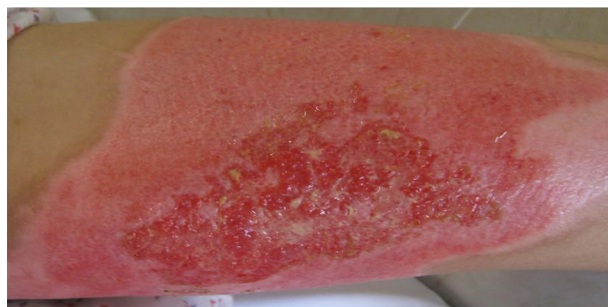
Figure 2. Burned Area After Two Weeks In the Conventional Group