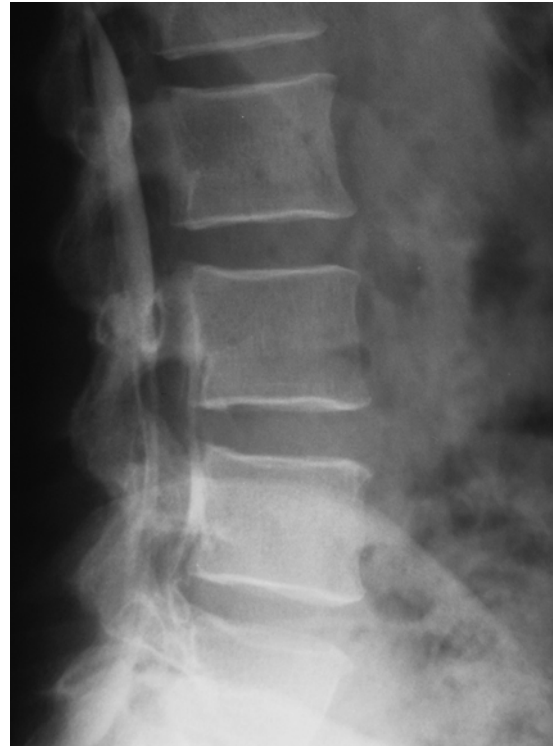
Fig. 1 Epidurogram shows access of the corticosteroid to the lumbar epidural space.

The primary target for injection was at the L4–L5