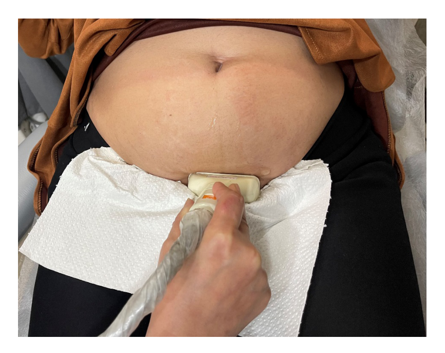
Figure 1. Ultrasound transducer placement for measurement