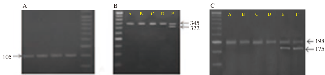
Figure 2. Electrophoretic pattern of thrombophilic mutations after PCR-RFLP. (A) FVL , All lanes are wild type (G1691A). (B) FII , Lanes A-D are wild type, lane E shows 345 and 322 bp, indicating heterozygous FII mutation (G20210A). (C) MTHFR , Lanes A-D are wild type, lanes E and F show 198 and 175 bp, indicating heterozygous MTHFR mutation (C677T).

& Mann-Whitney U is used and data are expressed as median (IQR); # t -test is used and data are expressed as mean±SD; * Chi -square test is used and data are expressed as n (%). Group A ( n =43) takes unfractionated heparin 5000 IU twice a day through subcutaneous injection; Group B ( n =43) does not take any antithrombotic drugs. BMI: body mass index; FSH: follicular stimulating hormone; E 2 : estradiol; IVF: in vitro fertilization.