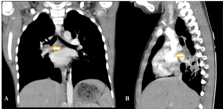
Fig. 1 – Chest CT scan. (A) Coronal view shows a mass lesion in the right bronchus. (B) Sagittal view also shows the mass and associated atelectasis. Arrows are shown the intrabronchial mass.