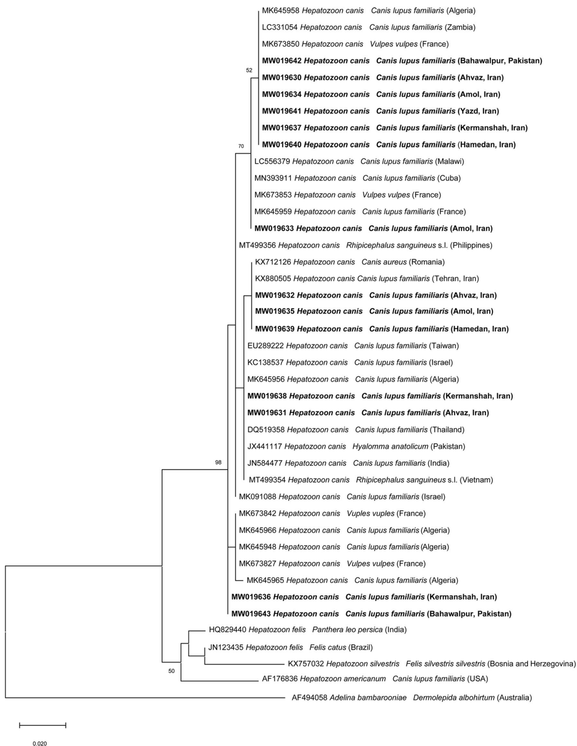
Fig. 2 Phylogenetic relationship of Hepatozoon spp. sequences isolated in this study (in bold) to other Hepatozoon spp. based on a partial sequence (327 bp) of the 18S rRNA gene. The analyses were performed using a maximum likelihood with Hasegawa-Kishino-Yano

model. A gamma distribution was used to model evolutionary rate differences among sites. Homologous sequence from Adelina bambarooniae (accession nos. AF494058) was used as the outgroup