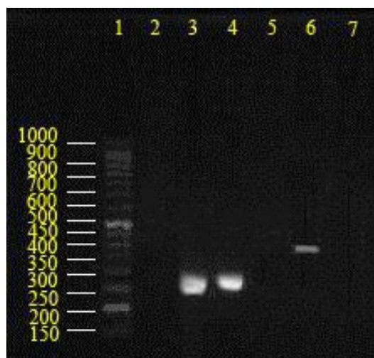
Fig. 3. Agarose gel electrophoresis for amplification analysis of bla_{TEM} and bla_{SHV} genes. Lane 1: 50bp DNA ladder, lanes 2: isolate without bla_{TEM} and bla_{SHV} genes, lanes 3-4: isolates with bla_{TEM} (271 bp), lane 5: negative control for reaction with bla_{TEM} primer, lane 6: isolate with 378 bp bla_{SHV} gene, lane 7: negative control for reaction with bla_{SHV} primer

due to its survival ability in such environments and causing nosocomial infections. In this study, among the aminoglycosides, amikacin was resistant in 67.1% of cases and in other groups; cephalosporins, carbapenems, and penicillin were almost 100% resistant, indicating multiple drug resistance in these isolates. Colistin was the most effective antibiotic (97.9%). Our results demonstrated that the rate of resistance was significantly lower in colistin compared to other antibiotics. The possibly reason for low resistance to this antibiotic may be owing to its infrequent prescription during the recent period. In a study conducted by Shahcheraghi et al (2009) on A. baumannii isolated from patients hospitalized in Tehran hospitals showed a large proportion of isolates were resistant to ceftriaxone (96.8%), cefotaxime (95.7%), ceftazidime (78.9%), and cefexime (100%), while 95.8% of isolates were susceptible to colistin, which their findings were consistent with current study. This study, like the studies carried out by Tseng et al in China in 2007 13 and Smolyakov et al in 2000 14 , confirmed that most isolates were resistant to ceftazidime and cefepime. Regarding the present results and similar studies, due to over-administration of the third generation cephalosporins and lack of observing the hygienic principles in the community, a