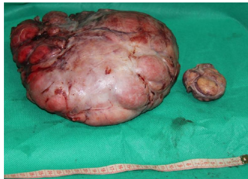
Figure 1. In macroscopic evaluation, large tumor had gray color and nodular surface with semi solid consistency.